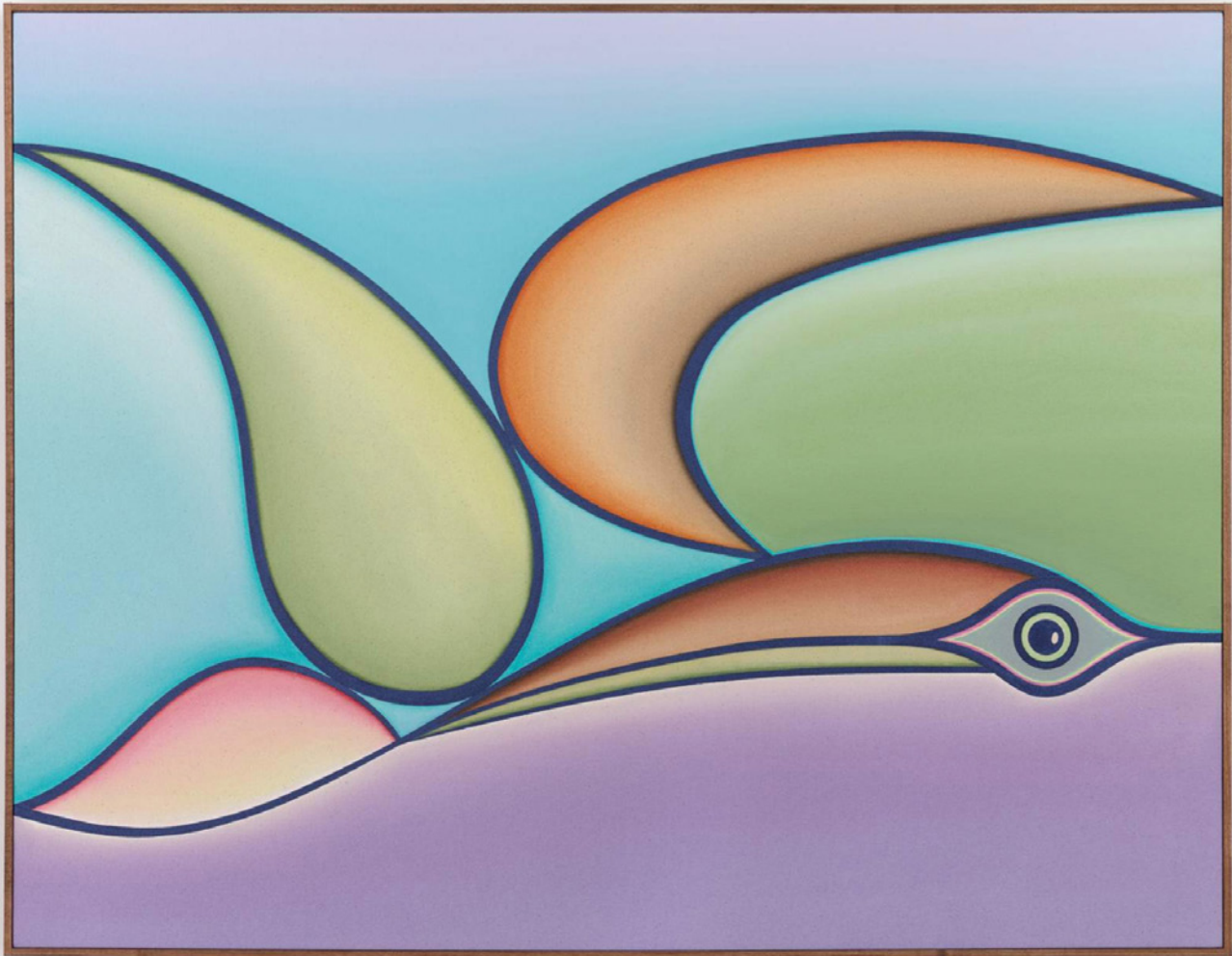
Anthony Miler, Not Titled , (2023).